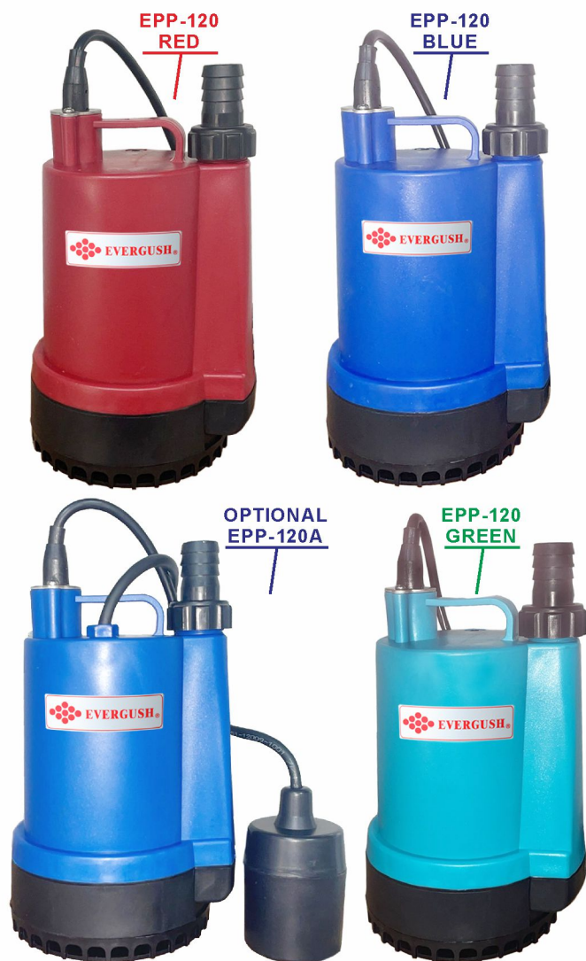
With float switch